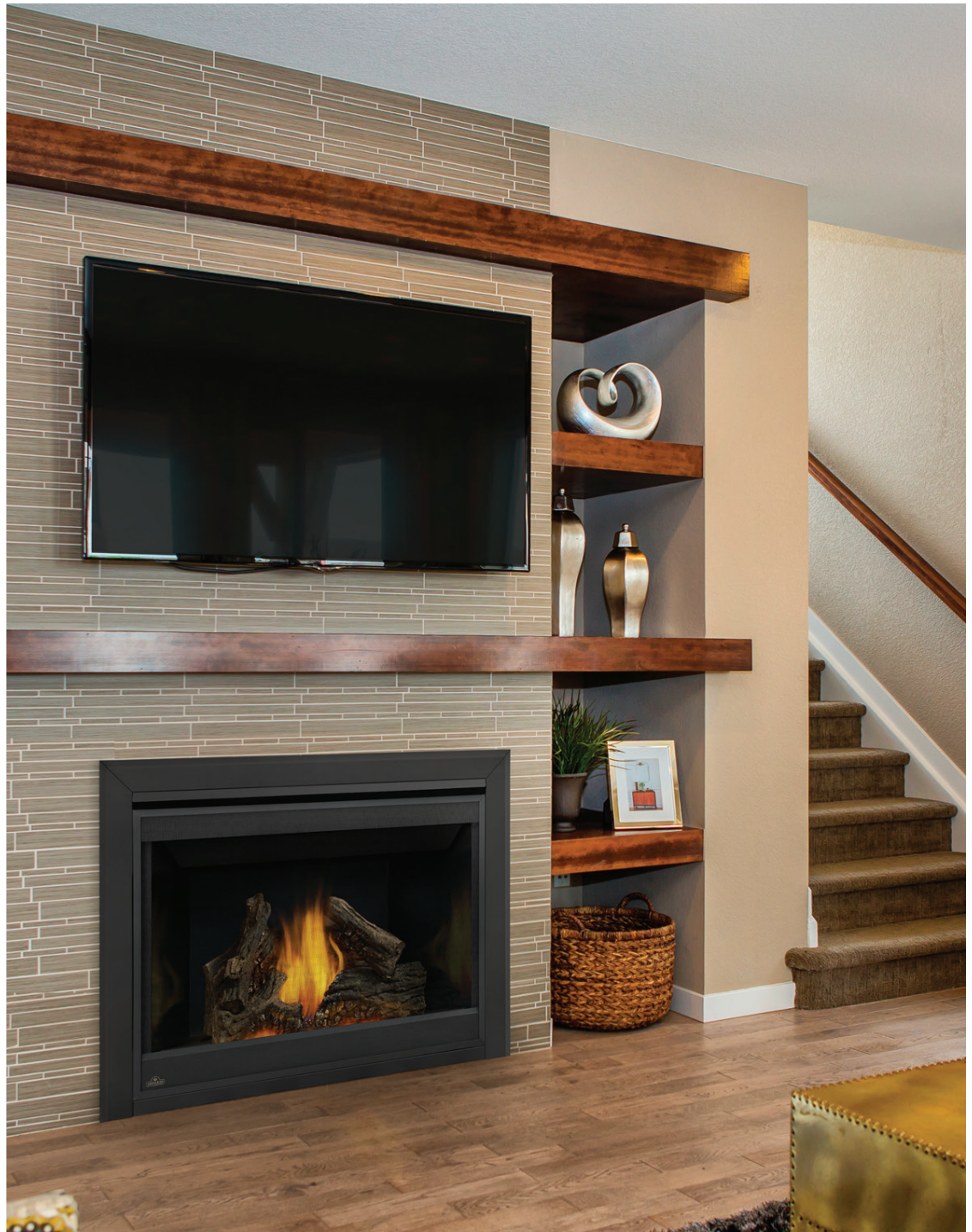
Ascent™ 46 shown with 3" bevelled trim kit and MIRRO-FLAME™ Porcelain Reflective Radiant Panels