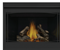
Zen Decorative Front