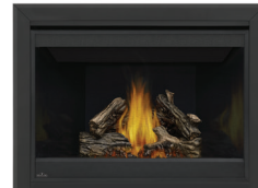
Premium 3" Bevelled Trim Kit