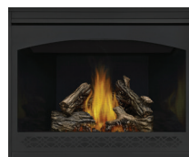
Heritage Decorative Front