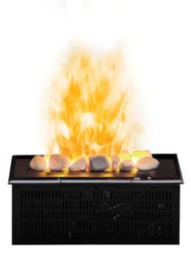
DFI400RH | 120V plug-in cassette with receptacle for optional heater 16" \times 8^{1}/2" \times 8^{5}/8" (WxHxD) 40.6 \text{ cm} \times 21.6 \text{ cm} \times 21.9 \text{ cm}