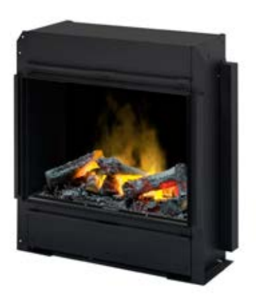
Opti-myst® Pro BOF6056L | Large Portrait 25½" x 275%" x 105%" (WxHxD) 64.8 cm x 70.2 cm x 27.0 cm

Direct-wired Thermostat-controlled heater