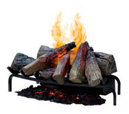
Opti-myst® Insert DLGM29 | 27" Opti-myst® insert 27" x 14"x 14¼" (WxHxD) 68.6 cm x 35.6 cm x 36.1 cm

• Direct-wired ☐ Thermostat-controlled heater