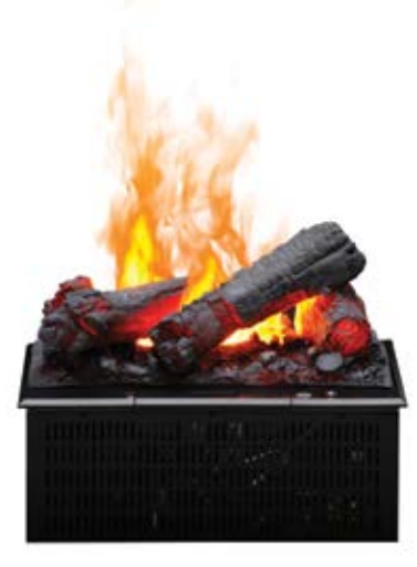
DFI400LH | 120V plug-in cassette with receptacle for optional heater 16"x 13" x 85/8" (WxHxD) 40.6 cm x 33.0 cm x 21.9 cm