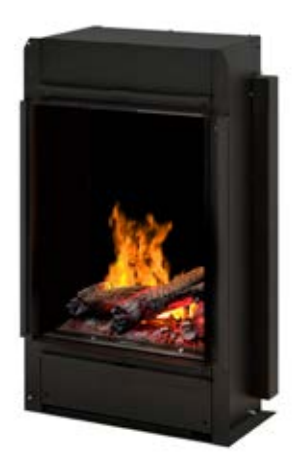
Opti-myst® Pro BOF4068L | Vertical 193/8" x 32½" x 105/8" (WxHxD) 49.2 cm x 82.6 cm x 27.0 cm

Direct-wired Thermostat-controlled heater