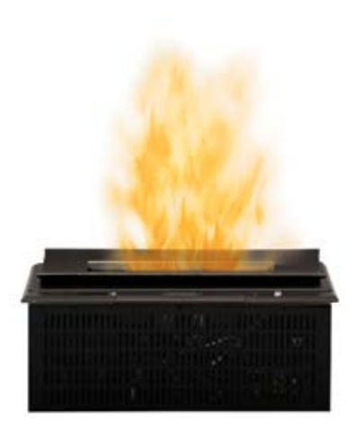
DFI400C | 120V plug-in cassette DFI400CH | 120V plug-in cassette with receptacle for optional heater 16" \times 8 ^{1} /8" \times 8 ^{5} /8" (WxHxD) 40.6 cm \times 20.6 cm \times 21.9 cm