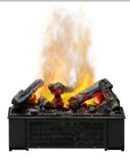
DFI600L | 120V plug-in cassette 221/4" x 13" x 85/8" (WxHxD) 56.5 cm x 33.0 cm x 21.9 cm