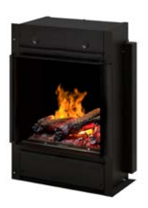
Opti-myst® Pro BOF4056L | Portrait 195/8"x 275/8"x 105/8" (WxHxD) 49.8 cm x 70.2 cm x 27.0 cm

Direct-wired Thermostat-controlled heater